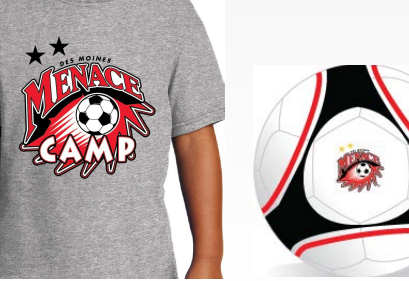
Camp shirt included in registration cost

Caspe Terrace • June 27-June 30 Ages 3-4 $65 | 5-8: $85 | Ages 9-14: $105 All Ages: 9:30-11:00am