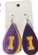
Purple & Gold Shimmer Leather Earrings ($15)