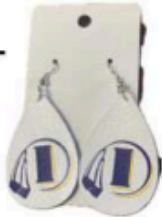
Dreamcatcher Leather Earrings ($15)