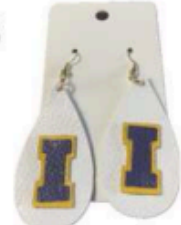
White w/Purple & Gold "I" Leather Earrings ($15)