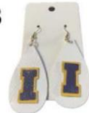
White w/Purple & Gold "I" Leather Earrings ($15)