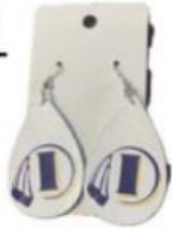
Dreamcatcher Leather Earrings ($15)