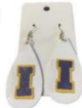
White w/Purple & Gold "I" Leather Earrings ($15)