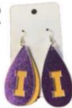
Purple & Gold Shimmer Leather Earrings ($15)